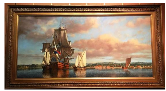
A painting of the merchant vessel Geldersche Blom (Flower of Gelderland) arriving at Fort Orange/New Netherland in 1652, by L. F. Tantillo